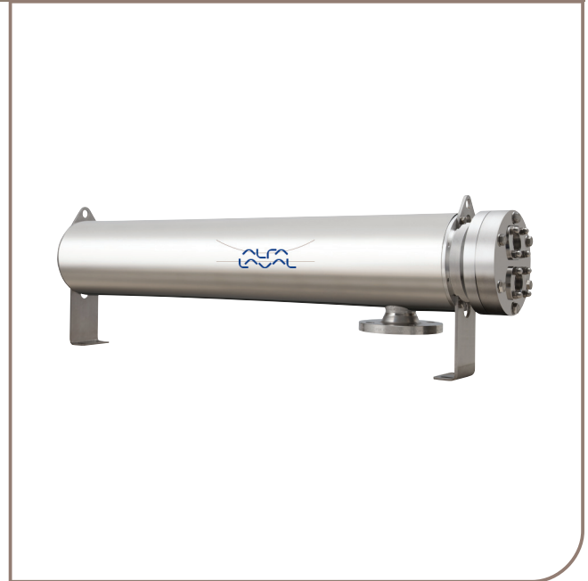
Fig. 1. Double tube sheets prevent cross contamination between the product and the heating/cooling medium.