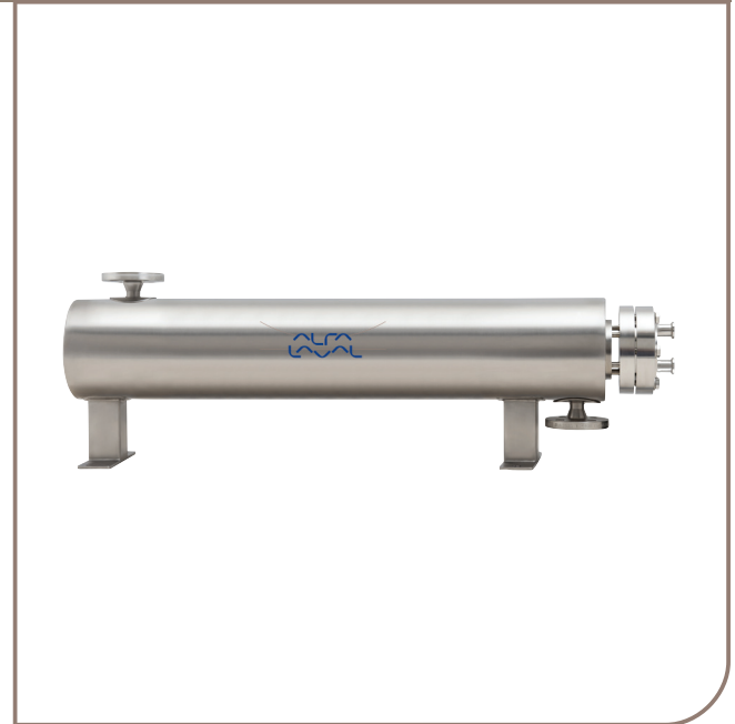
Fig. 1. Double tube sheets prevent cross contamination between the product and the heating/cooling medium.